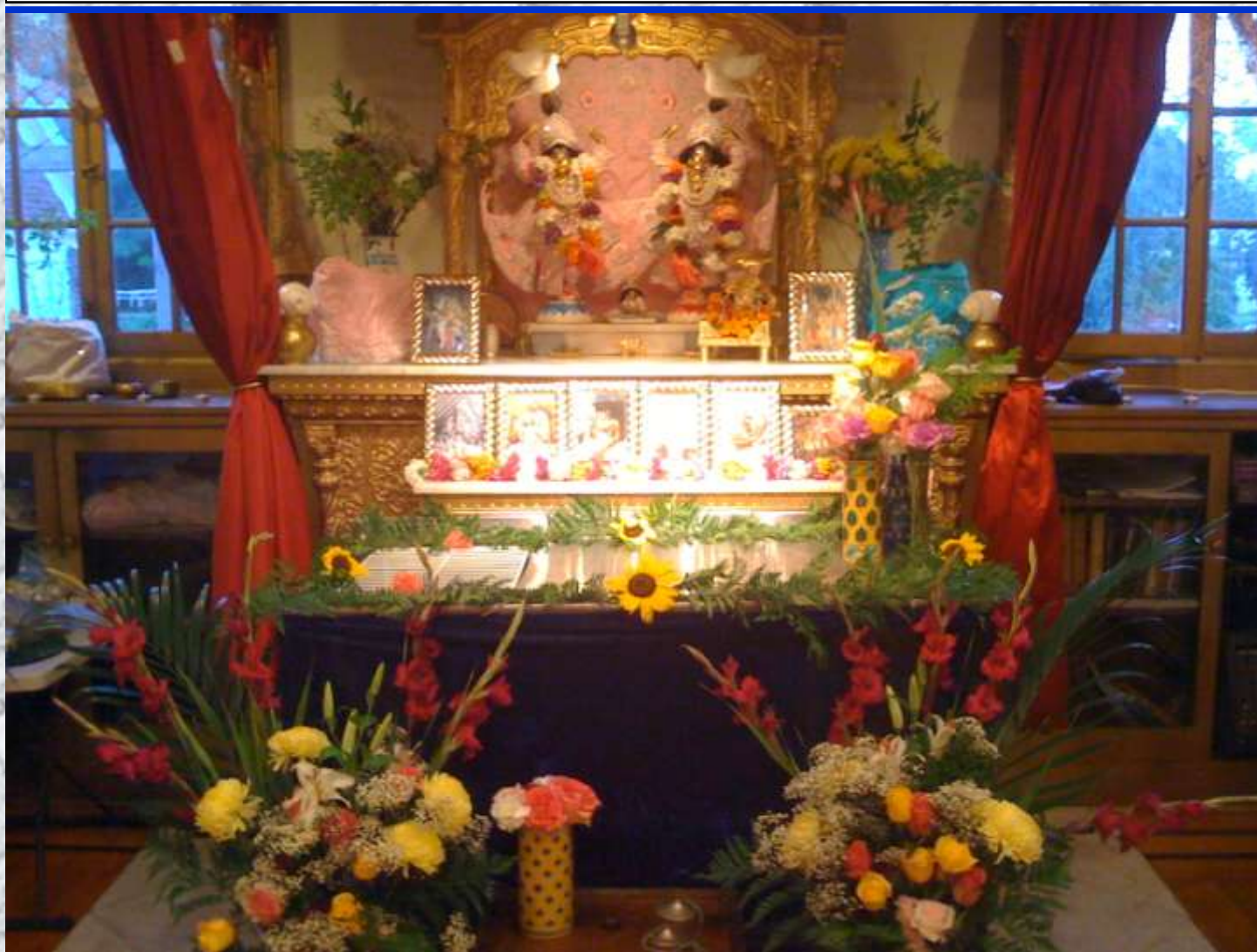
Deity Darshan, Sri Krishna Janmashtami, Saturday August 23rd, 2008